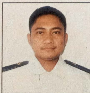
Batch No: 042-2018 SRN: 8701210012