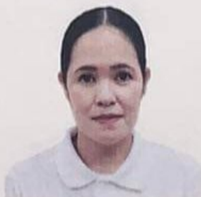
MORATO D A