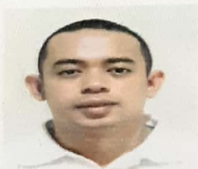
GRAYDA S P